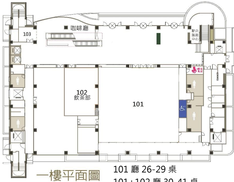
一樓平面圖 101 廳 26-29 桌 101+102 廳 30-41 桌